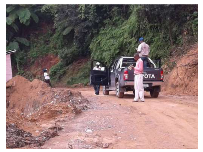
Major Landslide in Bellevue, Portland – Heavy Rains (April 2016)