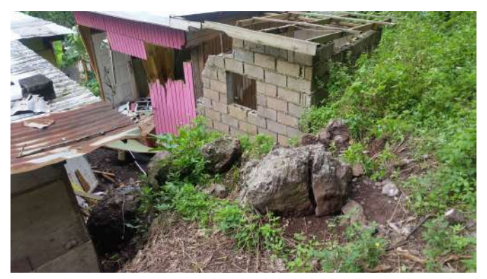
Landslide (Possible rainfall induced) in November 2016 – Resulted in the Death of 12 year old male child